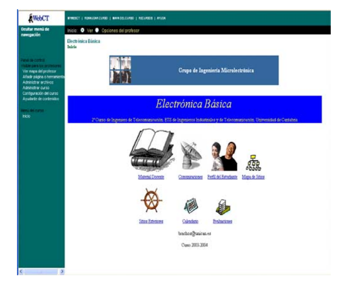
Figure 1: Microelectronic Circuit Course Home Page.

Figure 1 shows the home page constructed with WebCT for this subject, which demonstrates the accesses to the theoretical content, the set of exercises selected, the exercises prepared for this subject and the communication tools for use with the pages where the students can assess their progress in the subject.